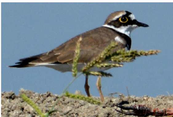
Little Ringed Plover

We then returned along the road towards the Dehesa de Abajo Visitor Center . Along the way we saw several good areas for birds and eventually stopped at one of them, a pool near the edge of the road. As usual there was a variety of species resting quietly in the evening sunshine, among them were Spoonbill , Spotted Redshank , Greenshank , Greater Flamingo , Green Sandpiper , Wood Sandpiper , Common Sandpiper , Cormorant , Moorhen , Coot , Little Ringed Plover , Kentish Plover , Common Snipe , Great White Egret , White Stork , Black Stork , Reed Bunting , Yellow-crowned Bishop