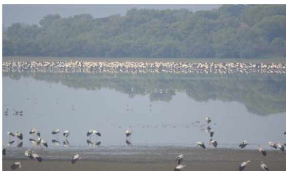
Dehesa de Abajo

After a quick cup of welcome coffee, we went for a short walk around the reserve car park, picking up Yellow Wagtail, Crested Lark, Jackdaw, Common Magpie, Red-Rumped Swallow, Woodchat Shrike, Common Buzzard , whilst down on the reservoir were hundreds of Glossy Ibis and White Storks , in association with Mallard, Teal, Gadwall and Shoveler .