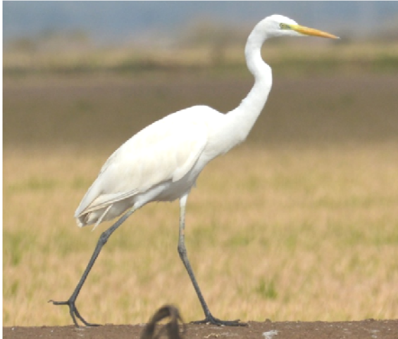
Great White Egret

Leaving the Centre we headed along the edge of the numerous rice fields in the Veta La Palma area, when we came across a channel with numerous herons, egrets and waders, productive since we added another two birds to our list, Great White Egret and Black Stork .